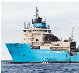
The Ocean Cleanup